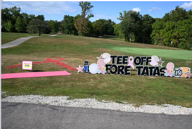
Tee Off “Fore” Ta-Ta’s and Pink Out