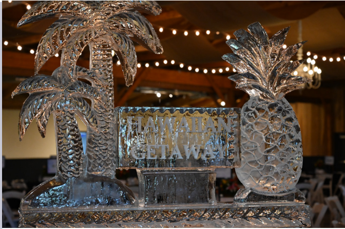
Hawaiian Getaway Gala